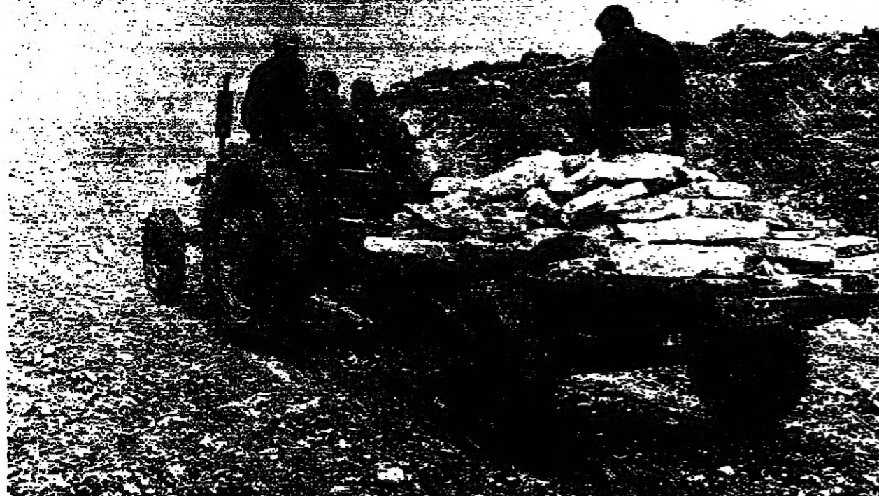
Rain or shine, work goes on the fields of Adamit in Galilee.